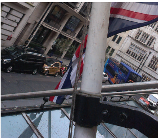
Old Wooden Flagpoles